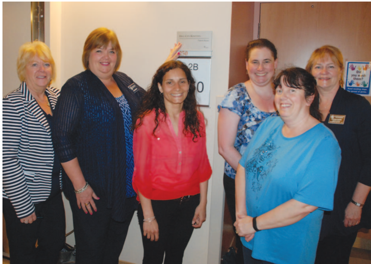
The Kinette Club of Thunder Bay Hill City are celebrating 75 years of making a difference in Thunder Bay. Through their service work, they have supported the purchase of specialized medical equipment and cancer research at Thunder Bay Regional Health Sciences Centre.

A portion of the proceeds will go to the Thunder Bay Regional Health Sciences Foundation. Come have a fun night out with baskets, door prize draw, 50/50 draw and more!